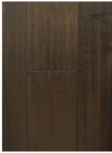
Barcelona Hand Scraped SAV502 (29.45 sf/ctn)