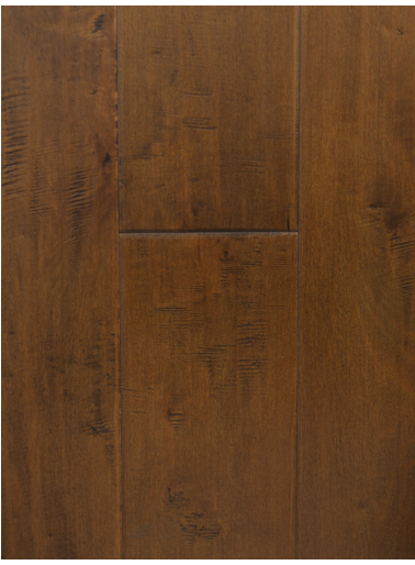
Sienna Hand Scraped SAV501 (29.45 sf/ctn)