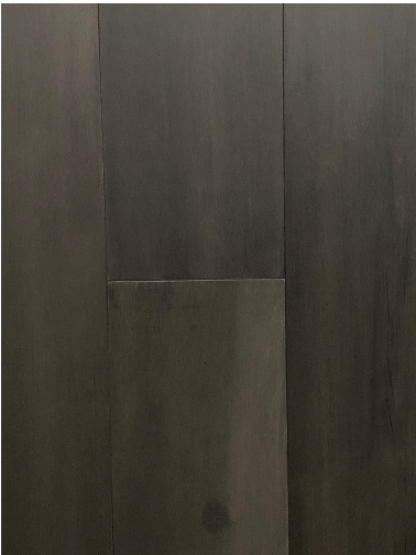
Royal Grey Hand Stained SAV932 (25.77 sf/ctn)