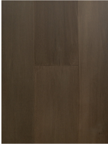
Sandlewood Hand Stained SAV930 (25.77 sf/ctn)