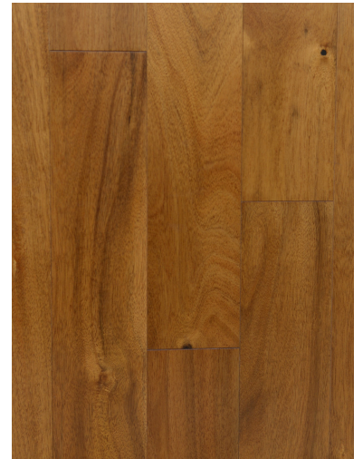
Small Leaf Acacia Amber Hand Scraped SAV171 (24.80 sf/ctn)