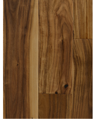
Big Leaf Golden Acacia Hand Scraped SAV111 (25.57 sf/ctn)